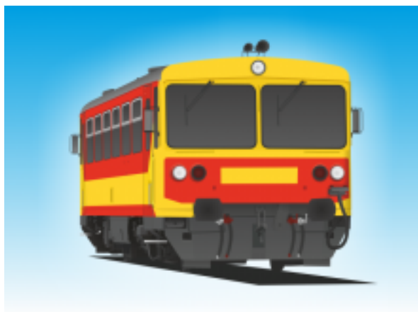
[9]Diesel multiple unit IV.

2 bicycles can be transported as a trolley in the multi-purpose space (on hooks in some vehicles).