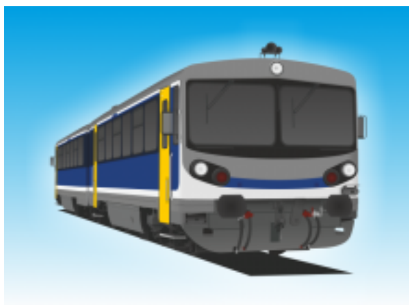
[10]Diesel multiple unit V.

2 bicycles can be carried in the train section marked with the bicycle pictogram.