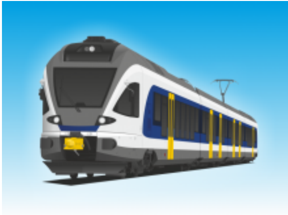
[1]Electric multiple unit I.

6 bicycles can be transported in the designated part of the passenger compartment (folding seats), secured by safety belt.