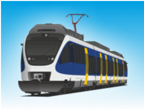
[3]Electric multiple unit III.

6 bicycles can be transported in the designated part of the passenger compartment (folding seats), secured by plastic straps.