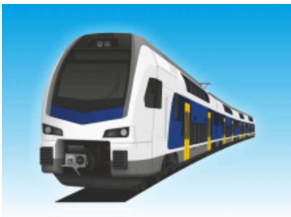
[2]Electric multiple unit II.

12 bicycles can be carried in a designated area of the passenger compartment (in the middle of the train), secured by safety belt.