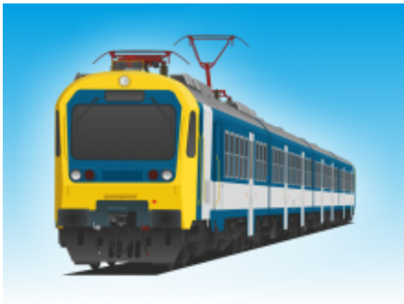
[4]Electric multiple unit IV.

6 bicycles can be transported in the bicycle transport compartment of the carriage, on hooks.